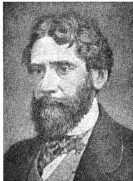
JOHN LOTHROP MOTLEY.