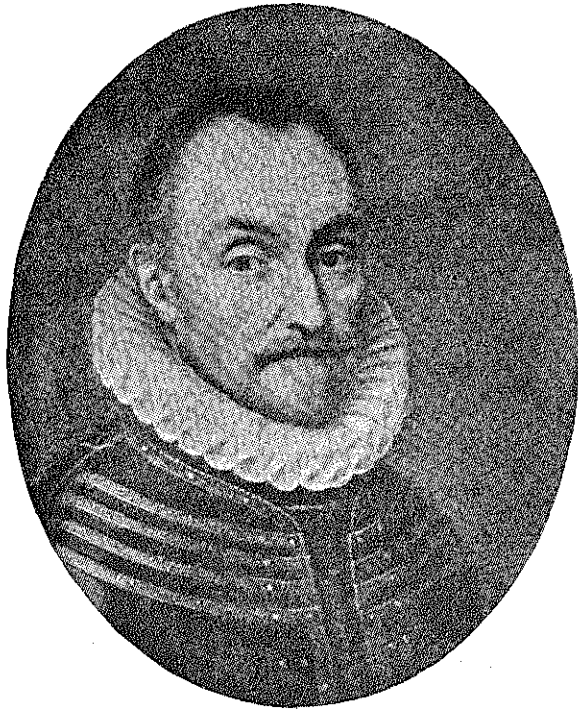
WILLIAM THE SILENT.

I will not detain your Excellency by a discussion relating to the first beginning of this important work; of the trouble it caused, and how at length these difficulties were overcome. Although it was only in May, 1737,